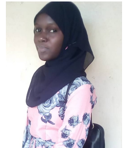
Mama Trawally Access Program